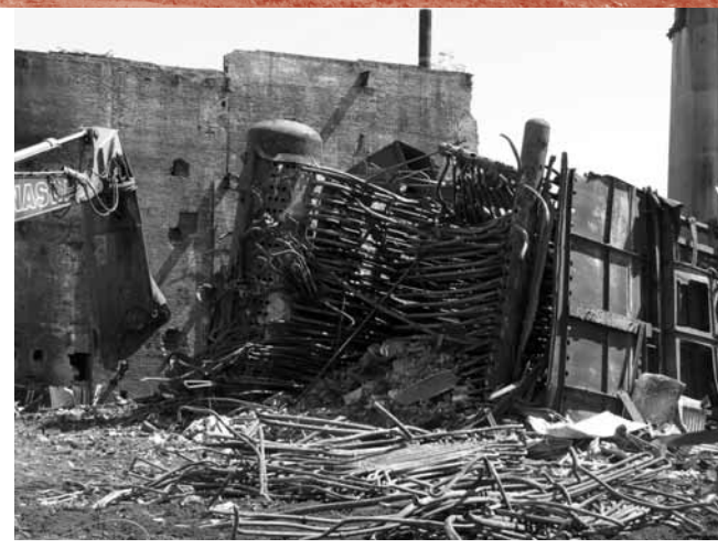
TOP: A truck getting loaded with steel to be hauled away from the stock piles in the foreground; boiler #5 is being torn apart in the background. ABOVE: An excavator with a lobster-type claw attachment made tearing apart the boilers quick and easy. BELOW: Safety to pedestrians and vehicular traffic on West Water Street was a priority, which made for cautious and slow demolition activities.

The remaining structures left on location will continue to support services in the future including communications and Taunton Police.